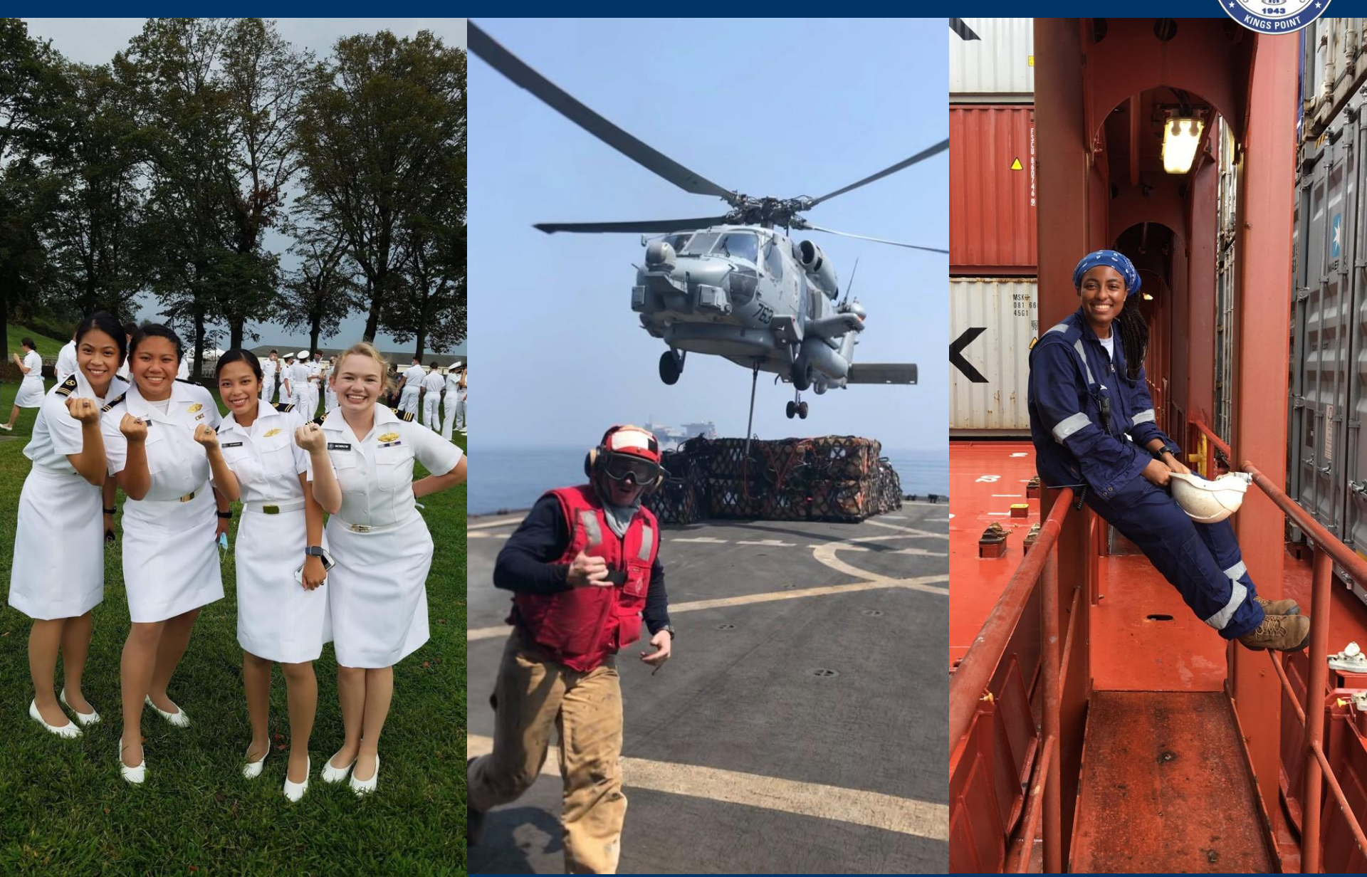
United States Merchant Marine Academy